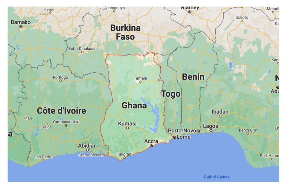
Fig. 1 Local geographical overview—the competitive situation.