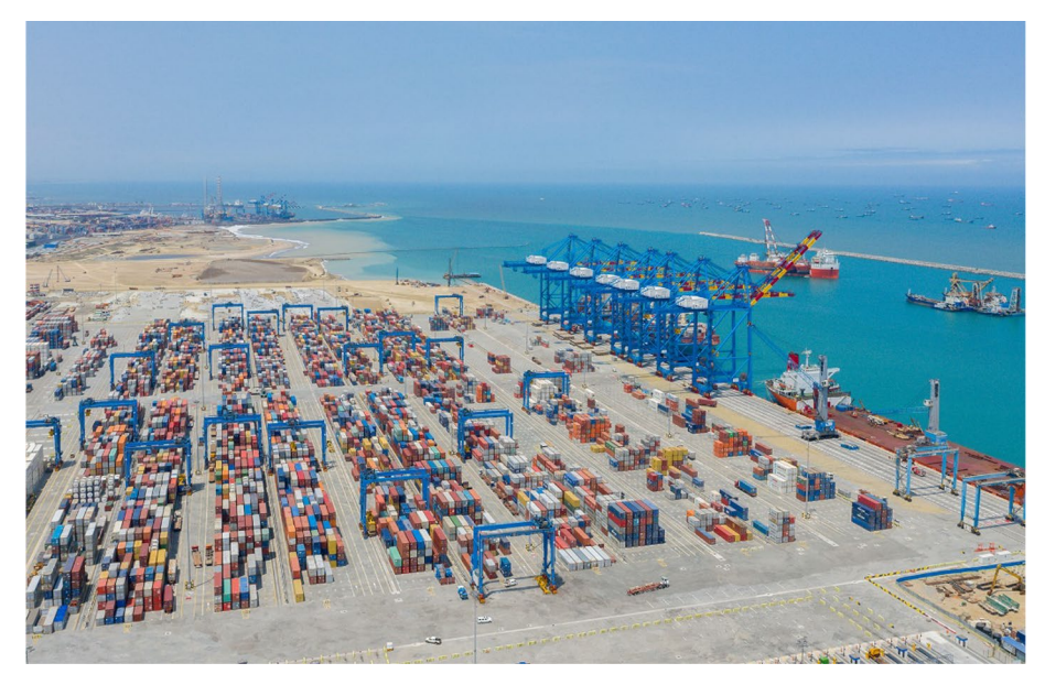
Fig. 2 View over the new Meridian Port Services terminal.

after the finish of the new MPS terminal. The new MPS terminal is a modern, highly automated self-service port from entry, control, and direction to exit, with advanced information technology (IT) and biometric scanning and routing tickets for truckers.